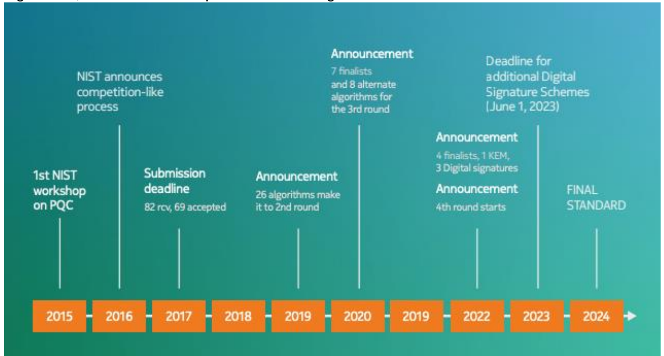
Figure 1: NIST PQC Competition Milestones as in [8]

migration process towards post-quantum cryptography. Cryptographic agility refers to the capacity of a system to accommodate, exclude or update new and obsolete algorithms, without severe impact to the existing infrastructure.