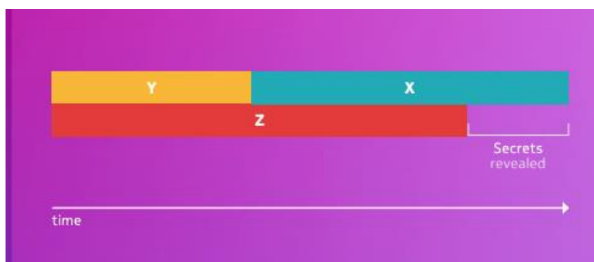
Figure 3: The Mosca model for evaluating PQC migration timeframe as in [8]

Even though quantum computers are still in an experimental status, their security implications need to be addressed already today. We need to get prepared for the post-quantum era with proactive strategies. Our role is to enable technology and knowledge transfer as well as foster collaboration to identify key areas that should be addressed during the initial steps for the introduction of quantum-safe solutions. Moreover, Industry needs to partner with leading universities to extend their in-house